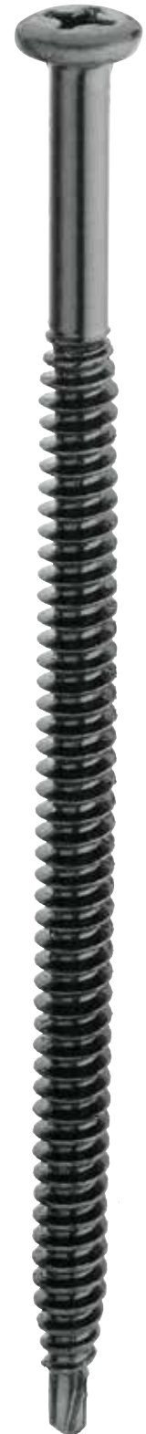
Enlarged to show detail.